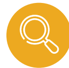
Image Analysis: Henry V

This activity works well after viewing the film, but it can be used at any point in the curriculum.